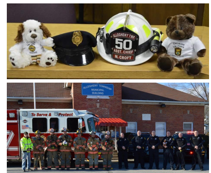
Allegheny Township Volunteer Fire & Police Departments